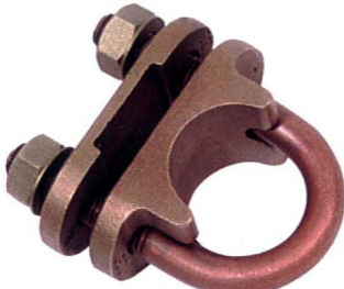
Double Plate - Rod to Tape